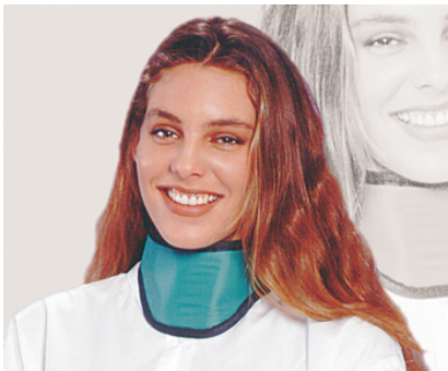
Collar Small HK for the protection of thyroid